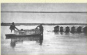
Historical photograph from the magazine "The modern landscape", 1932