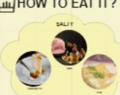
Il Materale Barenese