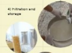
Il Materale Barenese