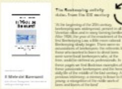
Il Materale Barenese